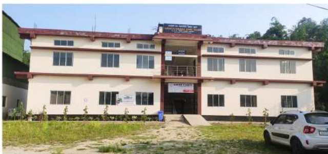
Narayan Chandra Borgohain Science Building