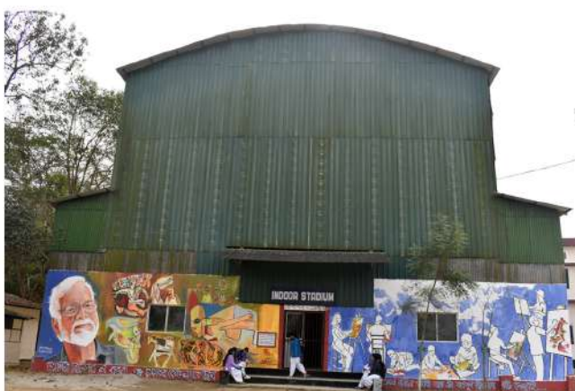
Kumud Sarma Yoga Centre cum Indoor Stadium

Statutory reservation policy of the government shall be followed in case of selection of eligible candidates for admission.