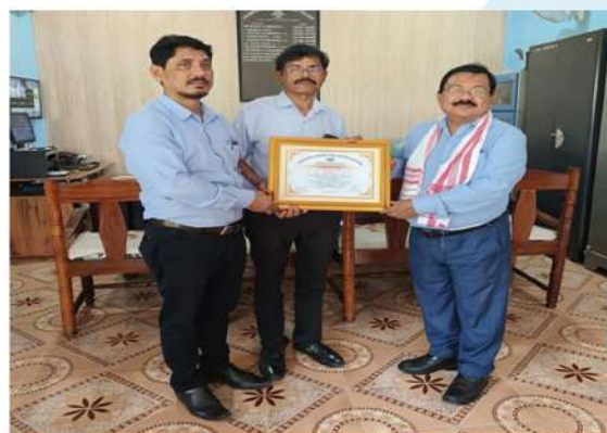
Officially recognized as a Centre of Excellence, reinforcing our commitment to Research and Innovation