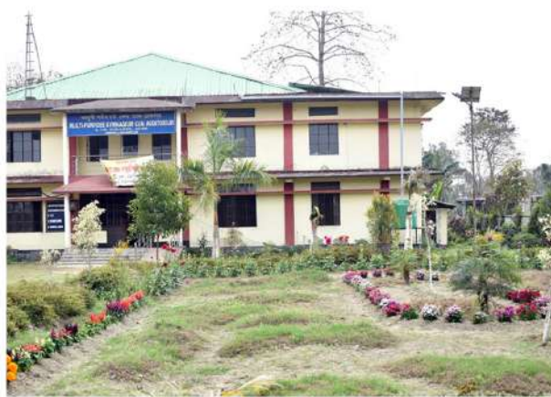
Indeswar Sarma Multipurpose Gymnasium cum Auditorium