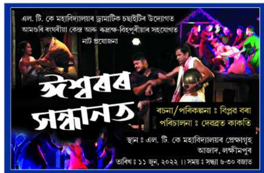
The L.T.K. college, Dramatic Society under the banner of Amguri Rangharia Bihpuria a programme on importance of Drama, "Ishwaror Sandhanot" was organised in the college auditorium on 11/06/2022

In the year 2017 the teaching faculties and students of the college with due permission of the college authority formed the L. T.K. College Dramatic Society with the aim of nurturing the dramatic talents of the students as well as providing the students with a platform to showcase their talents. The society has organised two drama in the college auditorium and conducted one workshop on Acting and Stage Performance in collaboration with NSD, Siliguri for the benefits of the students.