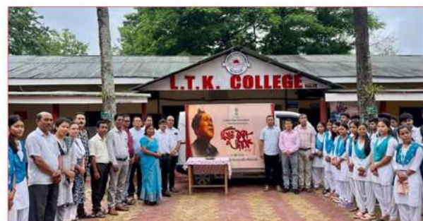
Celebration of Bishnu Rabha Divas in L.T.K College Premise on 20 th June, 2025