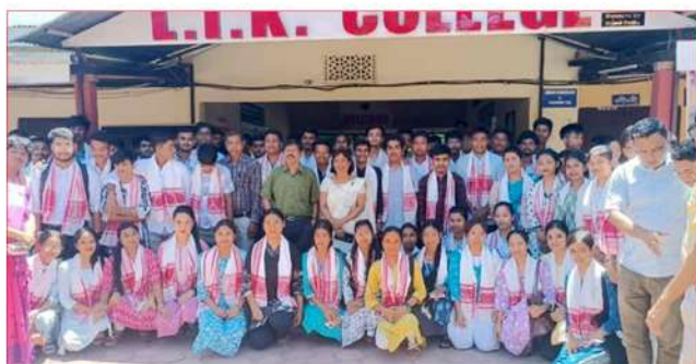
Felicitation Programme of the Students who Graduated from L.T.K. College in 2025