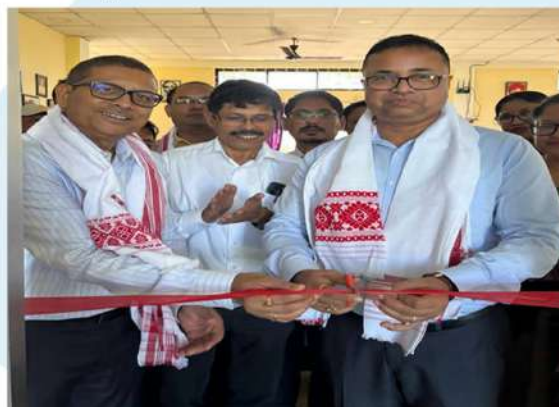
Sri Pranabjit Kakati, Hon'ble District Commissioner of Lakhimpur Inaugurated the UNESCO Library Corner