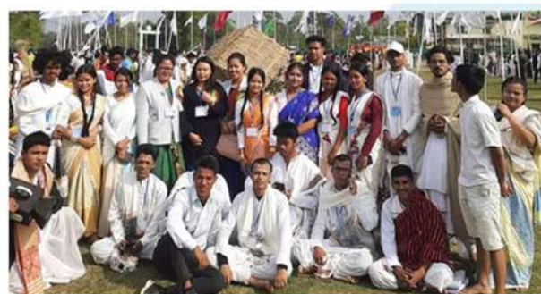
Cultural Rally 3rd Prize Dibrugarh University Inter College Youth Festival-2024